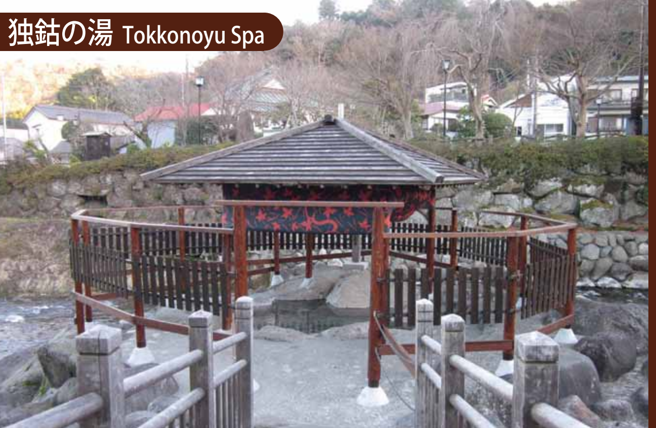
独鈷の湯 Tokkonoyu Spa

弘法大師空海が大同 2 年 (807 年) に関いたといわれる由緒あるお寺。鎌倉幕府 2 代将軍源頼家が幽閉され非業の死を遂げたことでも知られています。宝物館には岡本綺堂の名作「修善寺物語」ゆかりの寺宝の面などがあります。秋には境内の紅葉も楽しむことができます。 An ancient temple said to have been founded by Kobo Daishi (Kukai) in 807. During the Kamakura period (1185-1333), the temple served as the stage for the rise and fall of the Minamoto clan. Masks and other items connected to Kido Okamoto's famous kabuki play Shuzenji Monogatari are kept in the temple's Homutsu-kan treasure hall.