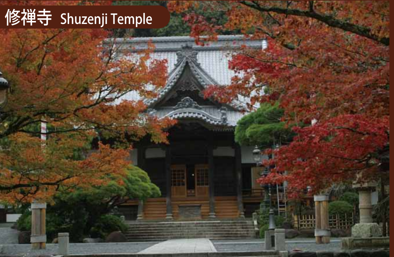
修善寺 Shuzenji Temple

Shuzenji Spa is said to have been opened by the famous Buddhist monk Kobo Daishi in the Heian period. A historic and sentimentally valuable hot spring district, the base of Mt. Daruma is filled with natural beauty, including the Shuzenji Plum Grove and Niji-no-Sato; here you can fully enjoy the blessings of Izu.