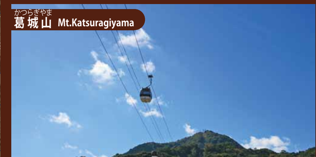
葛城山 Mt.Katsuragi 豆のなりたちを物語るさまざまな景観や富士山、狩野川の流れを一望できます。Mt. Katsuragi is also one of the "volcanic necks." From the mountain top that can be reached by aerial ropeway, you can get a view of various landscapes, Mt. Fuji and the Kanogawa River.