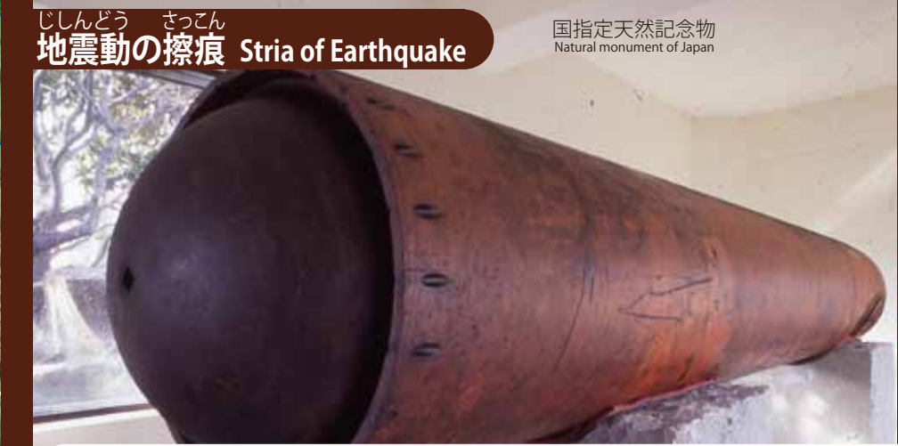
地震動の擦痕 Stria of Earthquake 丹那断層の活動で生じた北伊豆地震(1930年)による揺れが、戦没者慰霊碑に展示されていた魚雷側面にひっかかり傷として記録されました。The shock of the Kitaizu Earthquake occurred in 1930 as a result of activities made by the Tanna Fault was recorded as a scratch on the torpedo put on display on the war memorial.